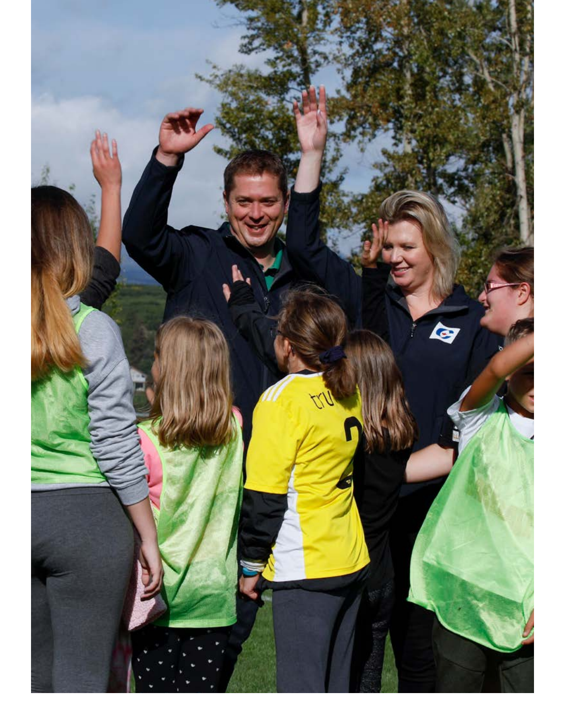
More For Your Child's Education Example, birth to age 18